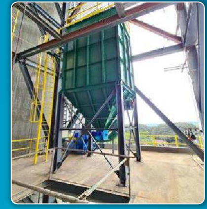
Northern Cement Corporation 8,000 CMH Finish Mill Dust Collector

Northern Cement Corporation 8,000 CMH Cement Grinding Dust Collector