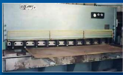
GOOK-DO CNC Hydraulic Shearing Machine 320 tons – 12mmt x 4,000mmL maximum capacity