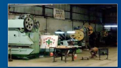
Mechanical Press Machines