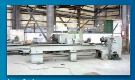
Long Bed Lathe Machine