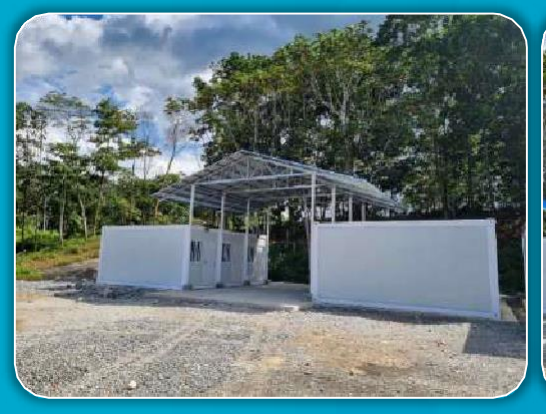
Philsaga Mining Corporation Prefab Container Warehouse