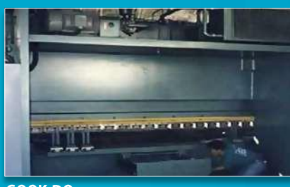
GOOK-DO CNC HydraulicBending Machine 12mmtx 2430mmL maximum capacity