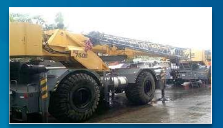
GROVE 60 tons Telescopic Rough Terrain Crane (2 units)