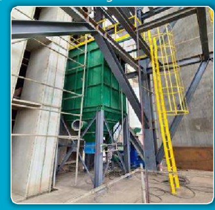
Northern Cement Corporation 45,000 CMH Crusher Dust Collector

Northern Cement Corporation 5,000 CMH Grinding Dust Collector