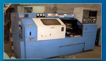
MASSA CNC Lathe Machine