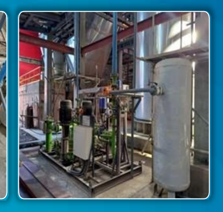
Northern Cement Corporation Pre-assembly/Installation and Alignment of 600,000 CMH Blower