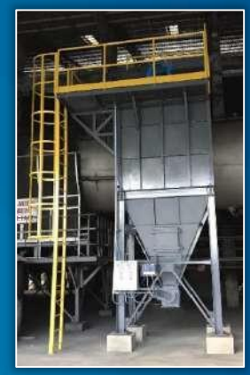
Treasure Island Industrial Corp. 7,800 CMH Dust Collector

Cenapro Chemical Corporation 2,100 CMH Dust Collector