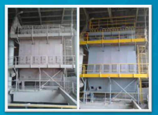
CRUSHER DC CONVERSION from SHAKER TO JET PULSE (Lafarge - Bulacan)