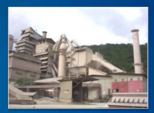
LURGI ELECTROSTATIC PRECIPITATOR Unit 1 & 2 (NCC)