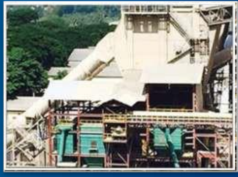
Northern Cement - 2 Units Lurgi ESP and 3 Units Coal Mill DC