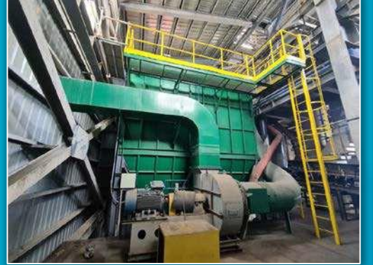
Northern Cement Corporation 20,000 CMH Fly Ash Silo Dust Collector

Northern Cement Corporation 36,000 CMH Finish Mill Dust Collector