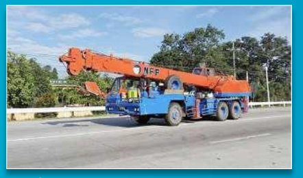
KATO 25 tonner Telescopic Truck Mounted Crane