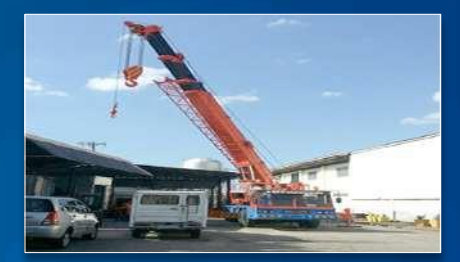
GROVE 45 tons Telescopic Truck Mounted Crane